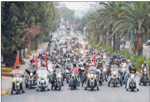
Open Weekend for all Harley and Non-Harley bikers in Oman

A FTER the success of "Make Every Day Count" in 2011 — Harley-Davidson's unique Open House Day concept that acted as a platform to introduce the new range of Harley-Davidson motorcycles for 2012 — Harley-Davidson Middle East and North Africa (MENA) has announced the 2012 Open House Days in Muscat under the theme "Join the Ride, Change Lives" inviting both riders and non-riders in countries including Oman, UAE (Dubai, Abu Dhabi), Qatar, Bahrain, Kuwait, KSA (Riyadh, Jeddah, Dammam, Jubail), Lebanon, Jordan, Egypt, Algeria, Morocco.